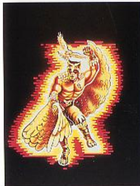
Level 1-2: Raptor™